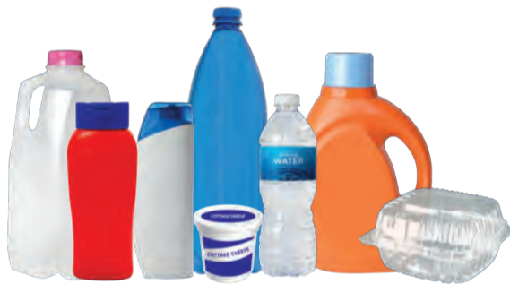
Plastic Bottles, Jugs, Tubs, & Lids

(Empty kitchen, laundry, & bath containers)