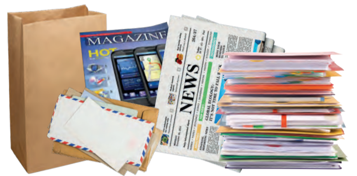
Junk Mail, Periodicals, & Office Paper