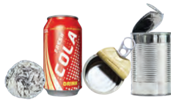
Aluminum & Steel Cans